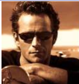
Patrick Dempsey is wearing Serengeti