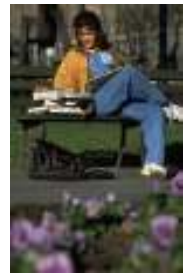
Student and senior citizen discounts—25% off!!

Anti-reflection coatings can help to reduce glare driving at night or using computers, they allow more light to the eye giving better vision and cosmetically are better than normal lenses looking less 'glassy'.