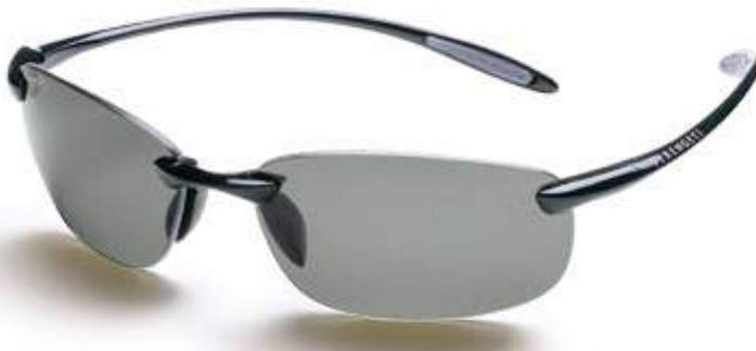
Lenses can be more suited to one purpose than another—some great for skiing, others for watersports, others for driving and so forth.