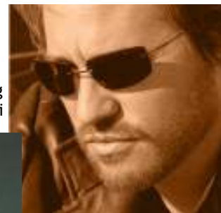
Val Kilmer wearing Serengeti

Read inside for more about lens technologies. There's more to lenses than meets the eye!