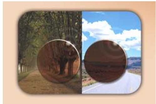
Photochromic lenses at work.

Polycarbonate lenses are made from one of the lightest, yet toughest, lens materials available. This allows for sunglasses to be made in rimless form (no-frame—just a bridge and sides) reducing the weight further while maintaining strength for active lifestyles, as well as normal frame styles.